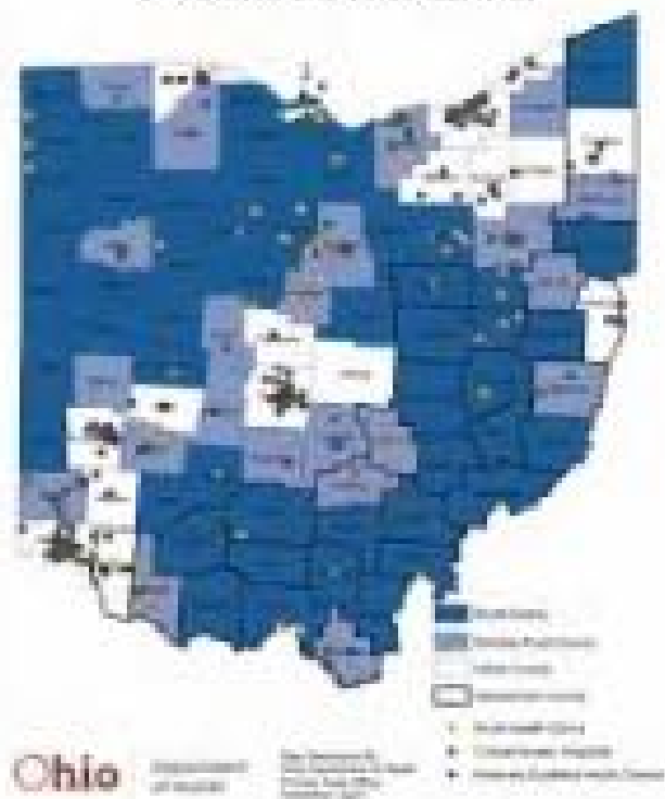
Ohio's Rural and Urban Counties